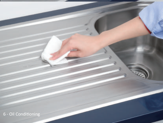
6 - Oil Conditioning