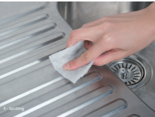
4 - Spotting