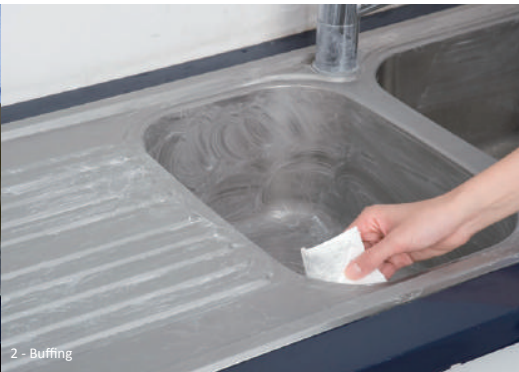
2 - Buffing