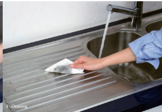
3 - Cleaning