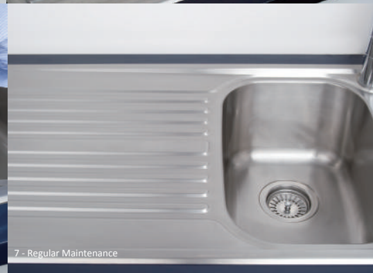
7 - Regular Maintenance