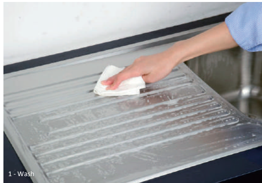
1 - Wash